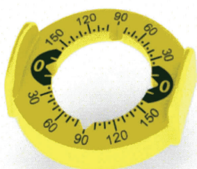
Intra-Operative Axis Guide