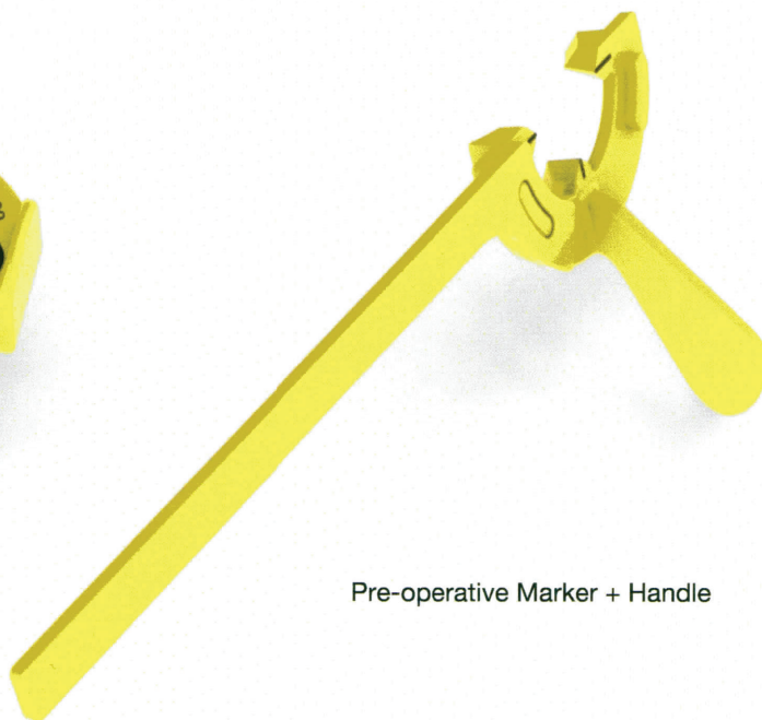
Pre-operative Marker + Handle